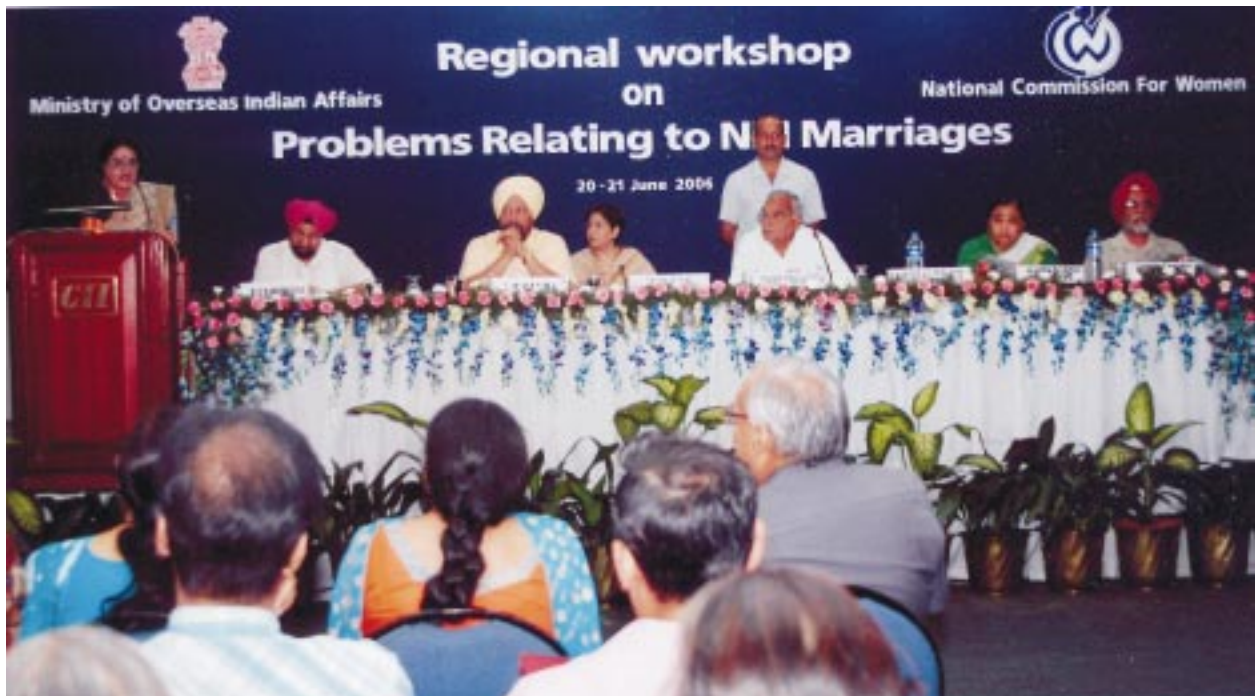
Dr. Girija Vyas, Chairperson, National Commission for women, addressing the regional workshop on problems relating to NRI Marriages held at Chandigarh

The persisting division of 'private' versus 'public' spaces which views the entry of law in homes as "bull in the china shop" has been largely responsible for keeping the homes considerably insulated from the legal system, notwithstanding the fact that some of the grossest rights' violations happen within the 'sacrosanct' four-walls of the homes. This dilemma, coupled with the sensitive and delicate nature of matrimonial relationships per se, are largely responsible for making the entire gamut of matrimonial disputes one of the most challenging and complex areas for legal intervention within any system. What makes it further complex particularly in the Indian context is the fact that in the absence of uniform civil laws, the personal laws of each religious community continue to be different in this country, thus making the matrimonial disputes, especially in inter-religious marriages, even more difficult to deal with.